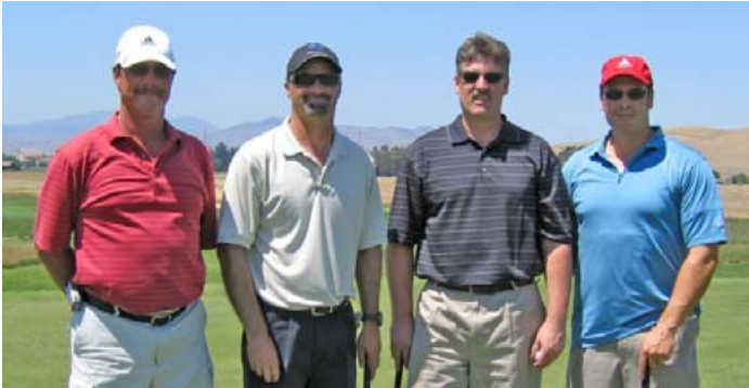
First Place Team - after the tie-breaker procedure.