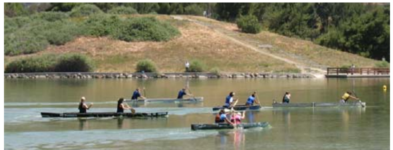
Showdown on Lake Cunningham!