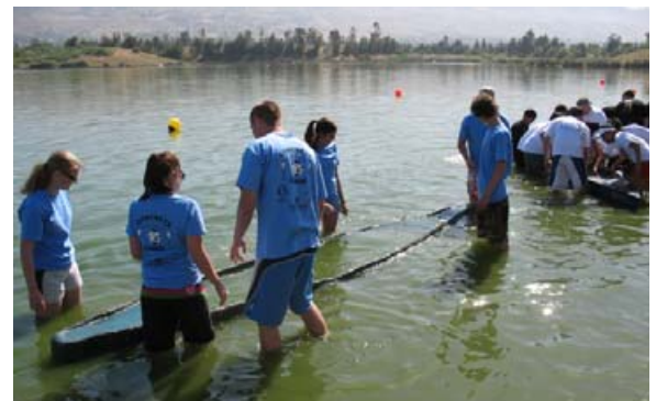
Flooded boats had to float.