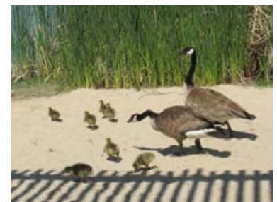
Nervous non-participants seek safety.