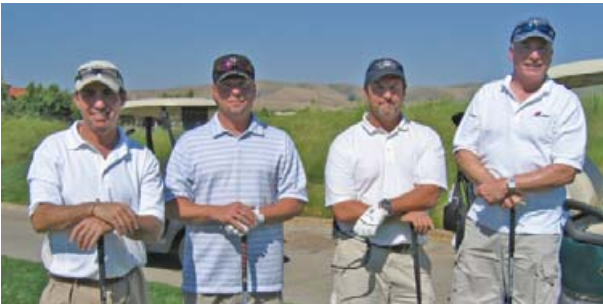
Second Place Team.