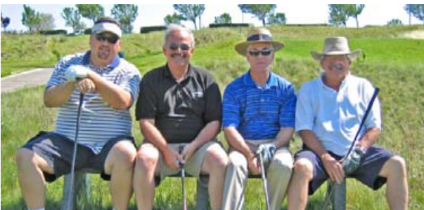
Third Place Team..