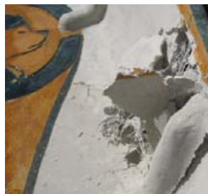
Unintentional structural testing by UNR on UC Berkeley's canoe.